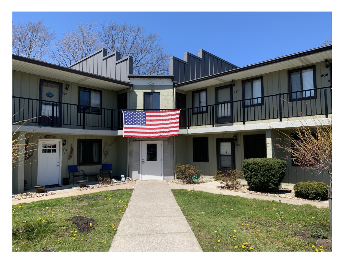
Showing support and solidarity, Dan Carlson, 609, requested to have the flag displayed over the entry to the Lounge ...